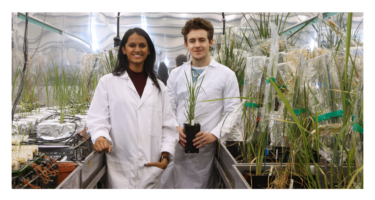
**Russell Group universities support a vibrant, diverse and productive research culture ***

In addition, Russell Group members were asked to contribute case studies which demonstrate examples of the work they are doing to support a vibrant, diverse and productive research culture in the UK. Full details of the case studies can be found in a separate short report.