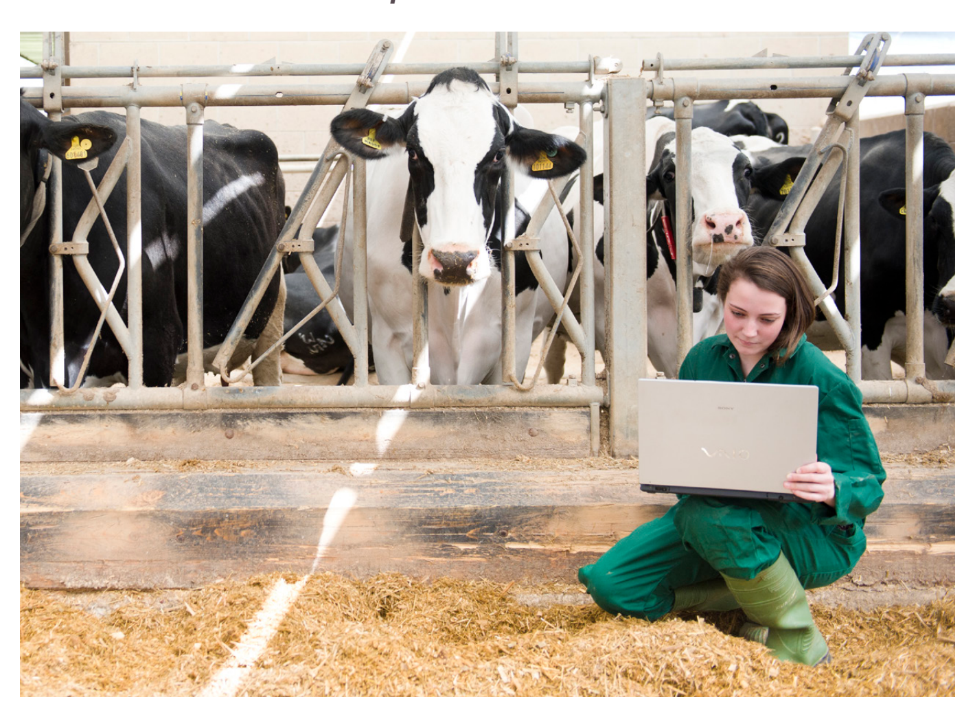
build wider research culture and environment values into hiring and promotion criteria

Where they are not doing so already, journals could use the Registered Reports published format, which involves peer review of research plans before data collection, in order to focus on the research question and methods, rather than the results. 41 This can help prevent poor quality research practices and publication bias. Funders could consider trialling the Registered Reports funding model, as Cancer Research UK is doing, for example, in which the assessment of grant applications is combined with the first stage of peer review of the Registered Reports format. 42 In line with this, publishers could explore and invest in new formats for publishing 'negative' results, in collaboration with universities.