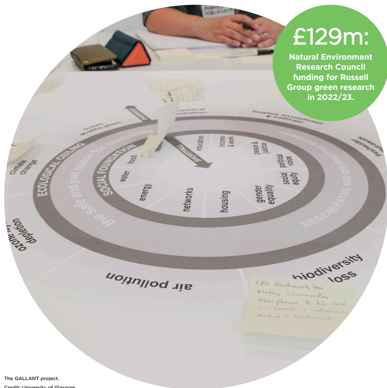
The GALLANT project.

Tackling the climate crisis and building a green future is an enormous challenge for communities across the UK. Meeting our emissions reductions targets responsibly means changing everything from the way we heat our homes to the way we produce food – but there are huge economic opportunities for the UK too.