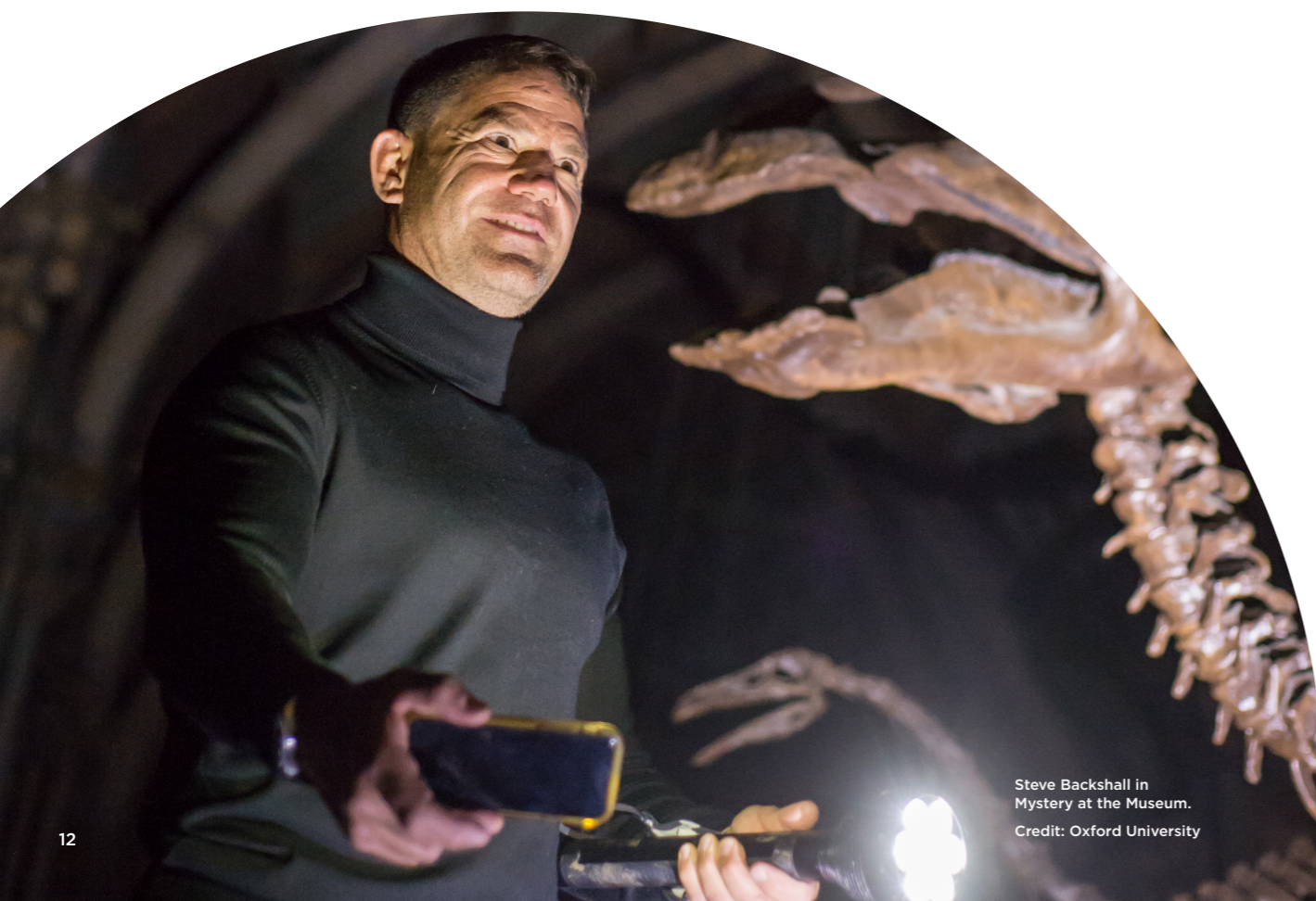
Steve Backshall in Mystery at the Museum.

The Age Friendly Whitworth programme contributes towards the NHS Greater Manchester Creative Health Strategy , which works to help people engage with creativity, culture and heritage to lead longer, healthier, happier lives.