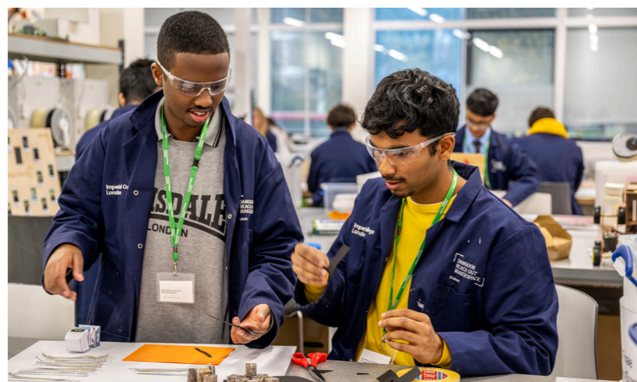
The Maker Challenge, Dangoor Reach Out Makerspace.

These are delivered in the Dangoor Reach Out Makerspace, a workshop and design studio which inspires local young people to gain hands-on experience of making and prototyping, including through cutting edge technologies such as 3D printers, scanners, laser cutters and woodworking equipment.