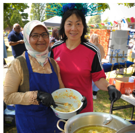
The Playing Out in Canley Parade, 2023.