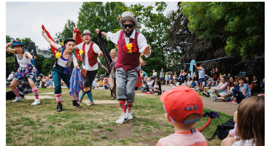
University of Southampton Turner Sims Summer Family Day 2023.

In July 2023, TS hosted a free Family Day, filling the venue and the grounds of Highfield Campus with music, performances and workshops. 19 artists took part and 1,200 people attended, many for the first time. A high proportion of families came from Southampton SO16 and SO17 postcodes, achieving the university's ambition of reaching hyperlocal communities - all contributing to the National Plan for Music Education.