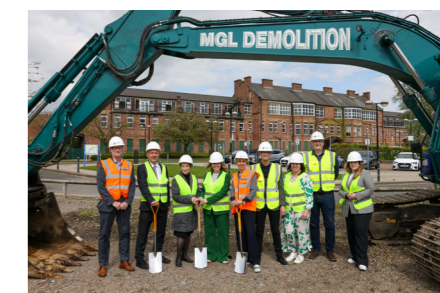
Newcastle's Health Innovation Neighbourhood development.

Russell Group universities employ more than 4,200 (FTE) clinical academics